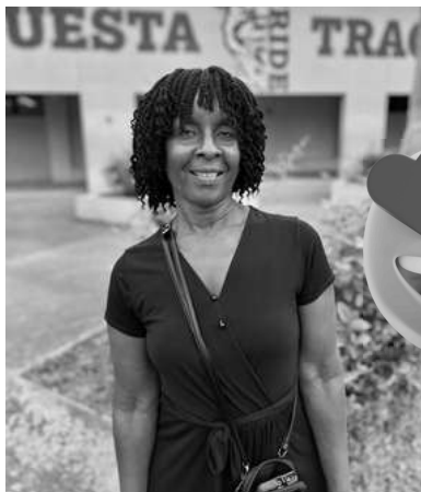
Teacher of the Year